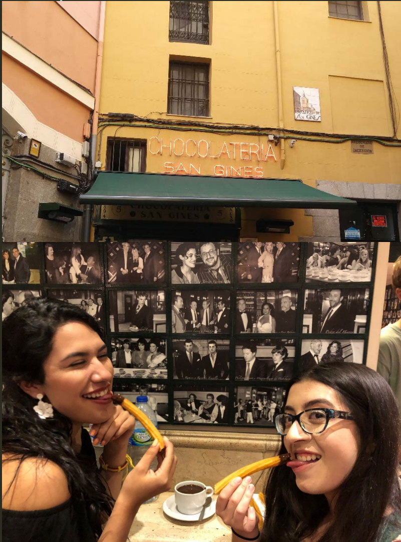
We visited a Chocolateria that served churros with hot chocolate.