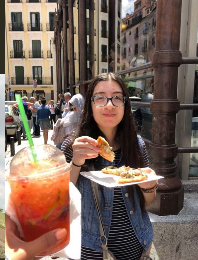
One of the best places to go in Madrid is the San Miguel Mercado. They sell all sorts of fruit, candy, tapas, drinks, and delicious food that will leave you craving more.