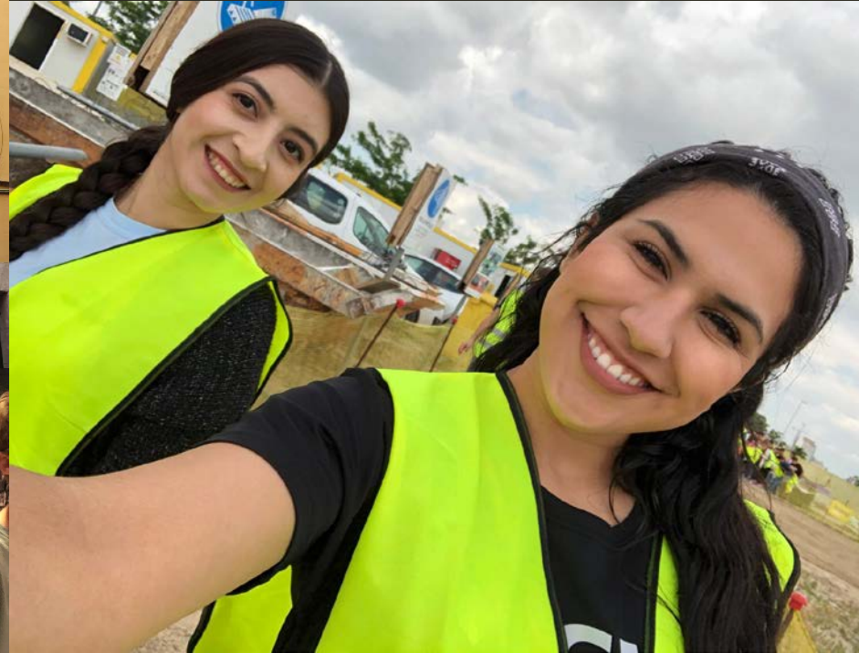
During a day field trip with the class, we were able to visit the construction site of a bridge.