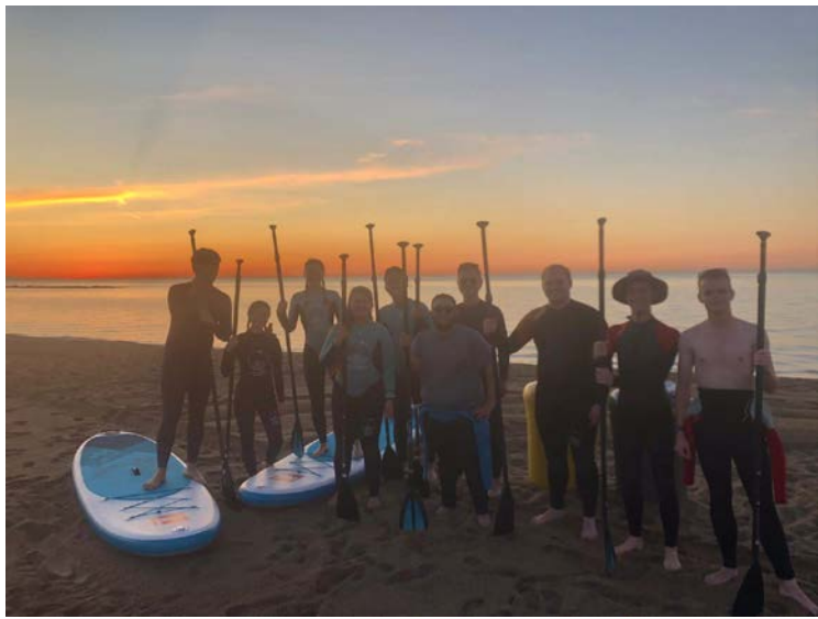
Sunrise paddle boarding In Barcelona