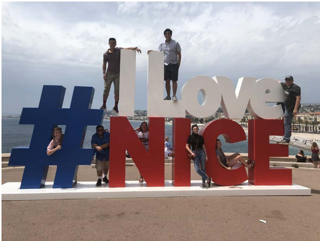
A Nice sign near the Promenade des Anglais