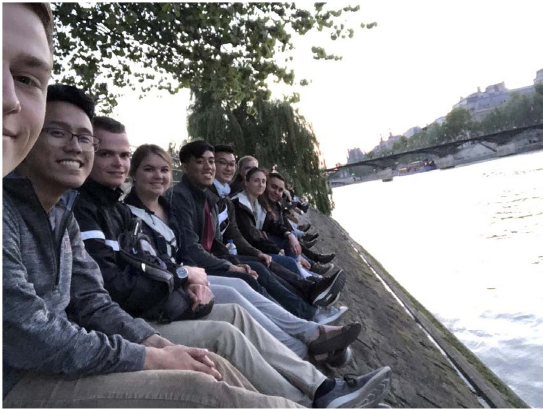
Point Neuf in Paris- great hang out spot to catch a nice sunset