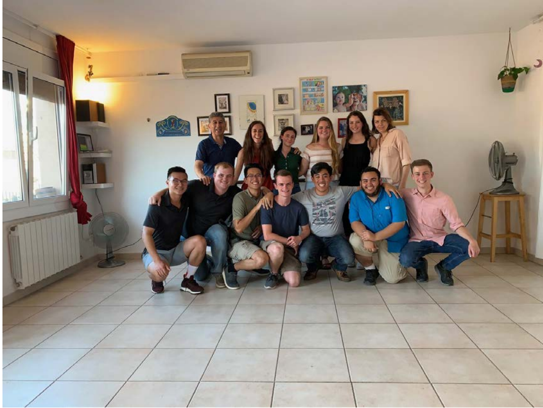
Argentine Tango lessons in Barcelona