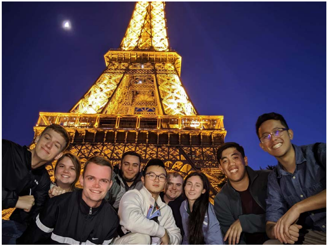
Eiffel Tower pics