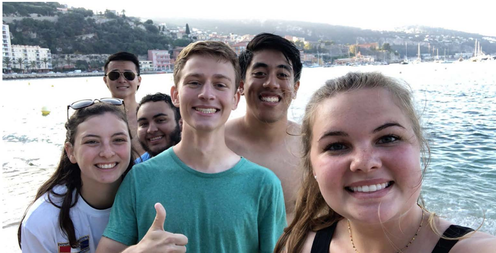
Promenade des Anglais in Nice