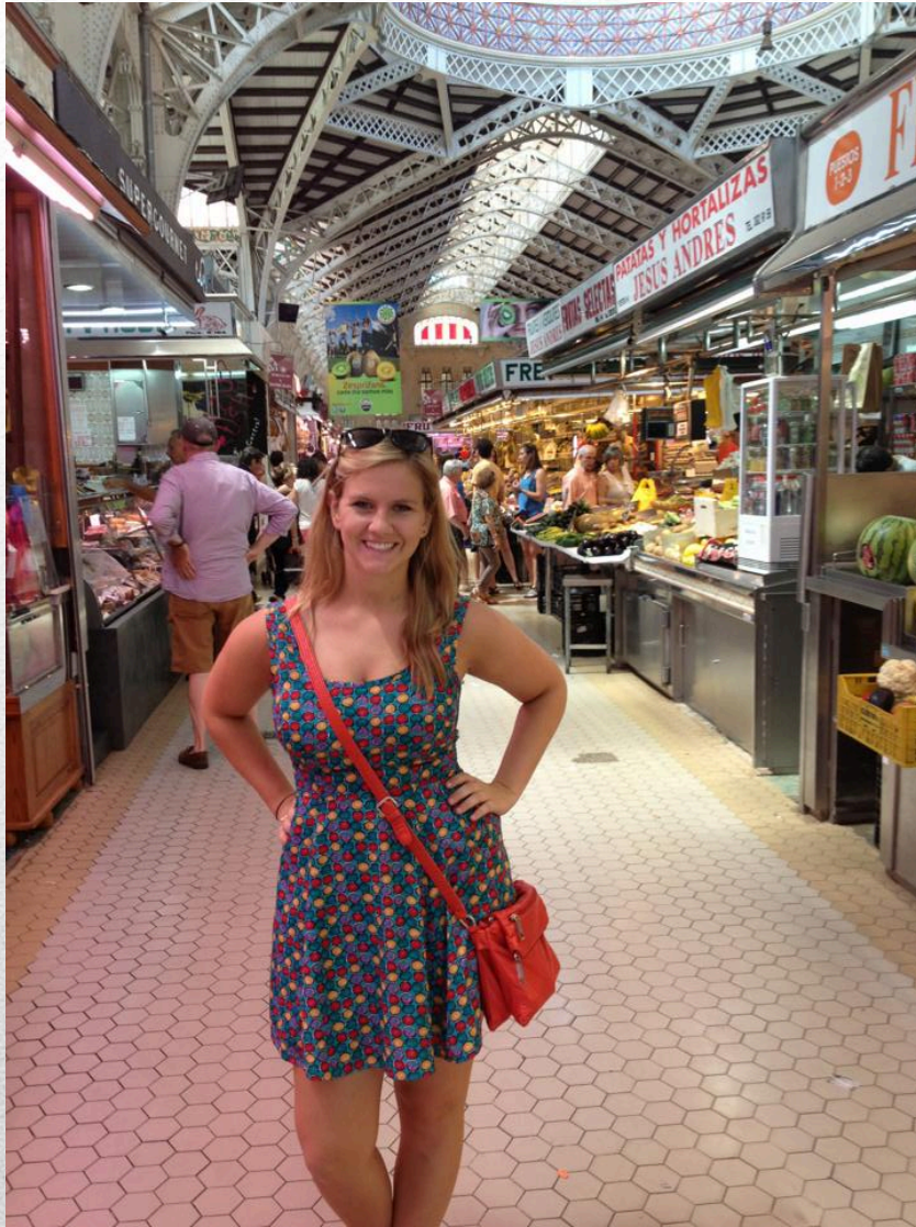
At the Mercado Central