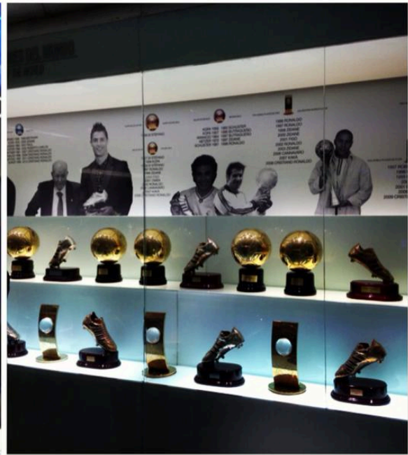
Took a tour of Santiago Bernabéu Stadium, the home stadium of Real Madrid