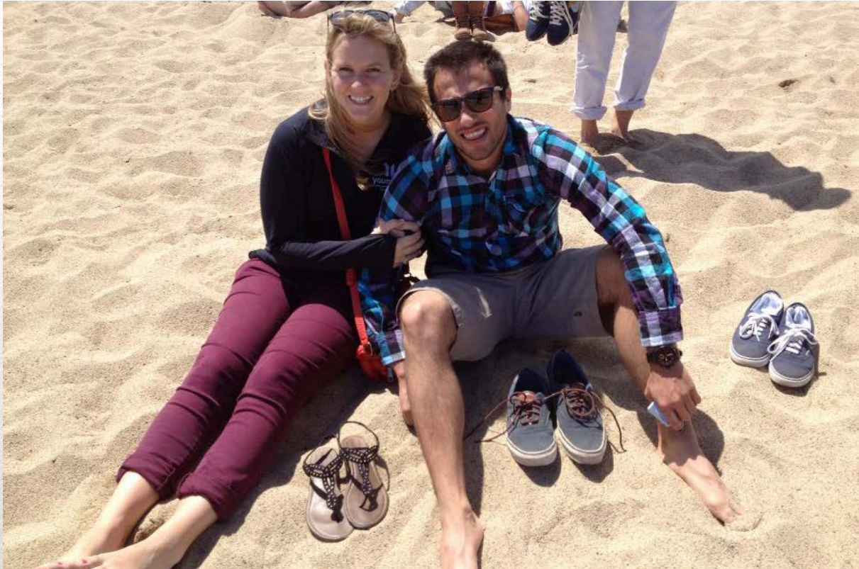
Beach Barceloneta in Barcelona