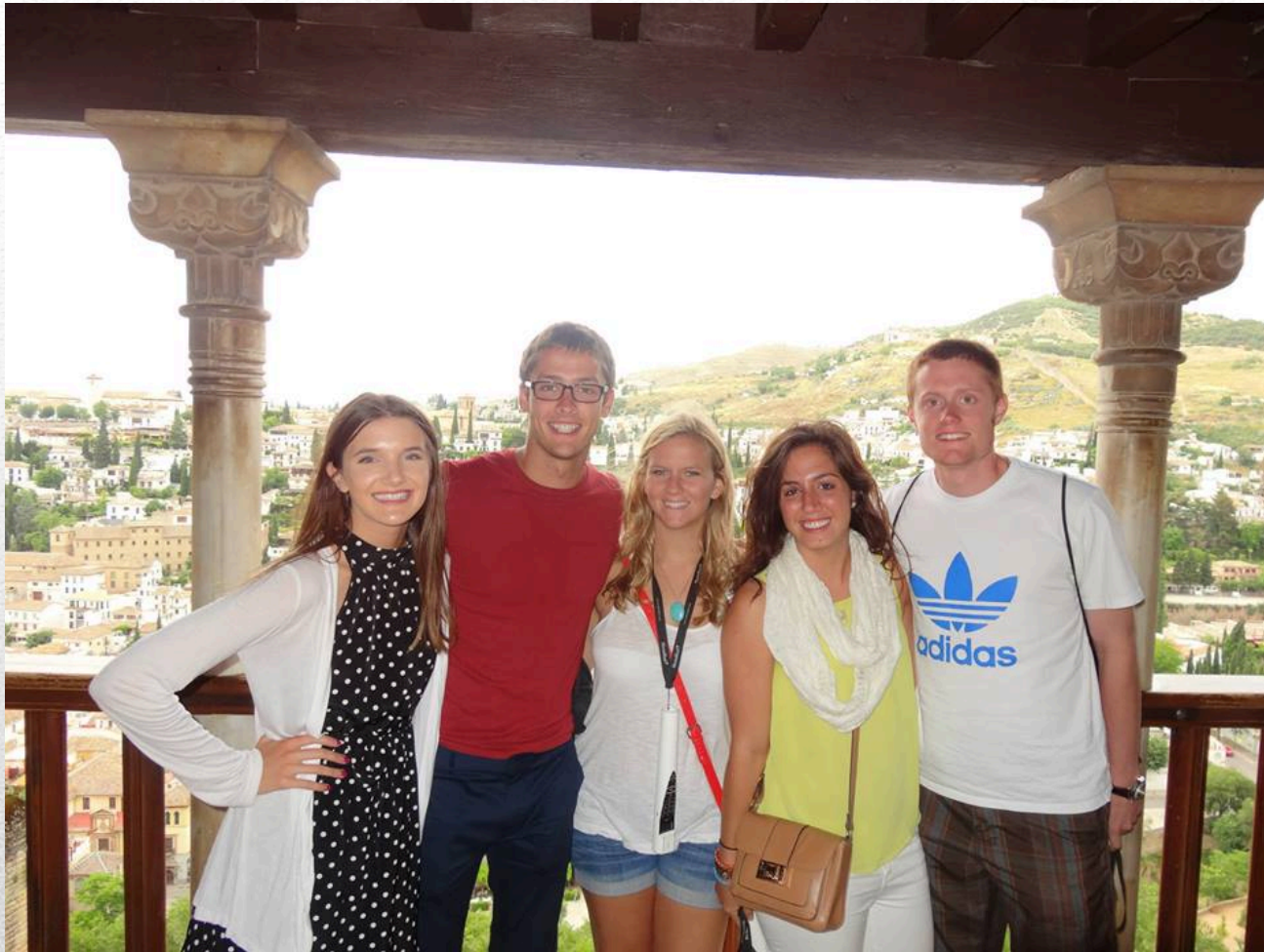
Day trip to see La Alhambra