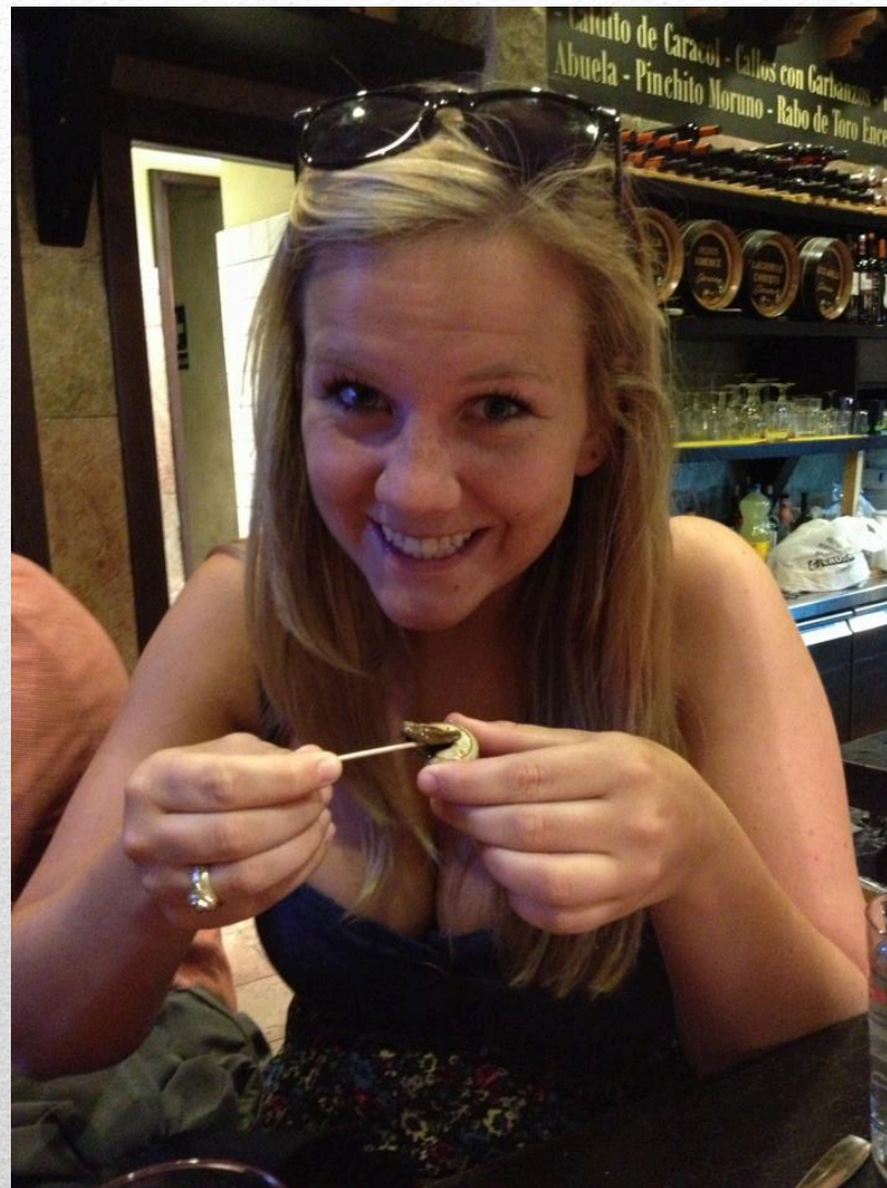
Eating snails in Málaga