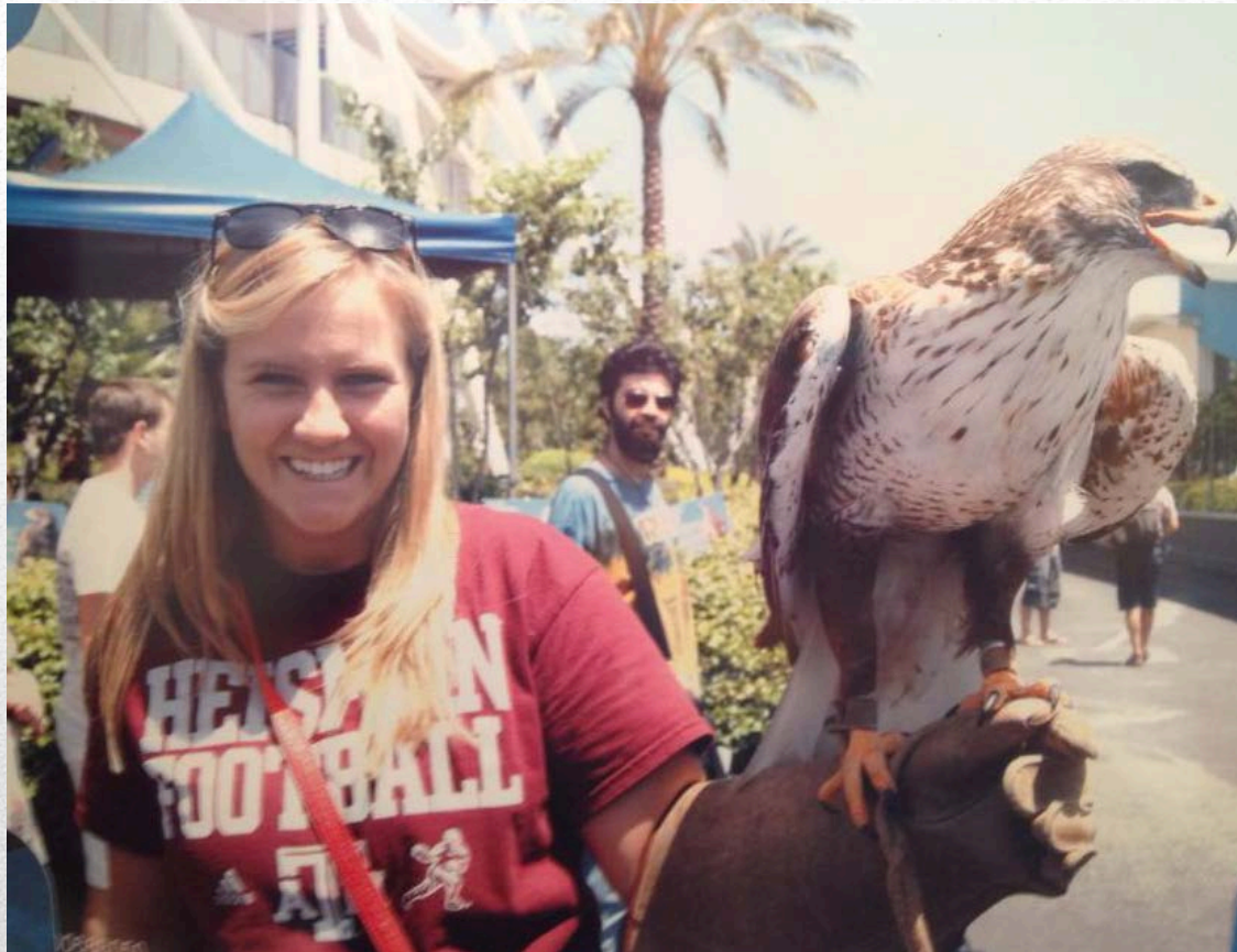
Got to hold an eagle at Oceanográfico!