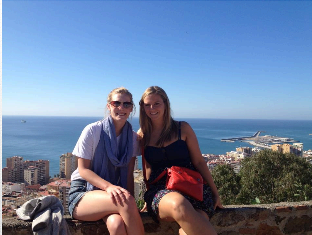
View over Málaga from Gibralfaro Castle