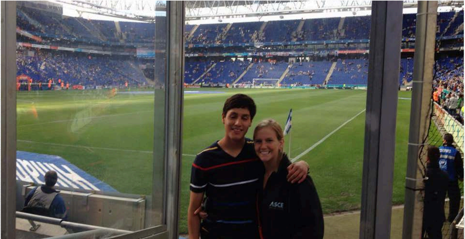
My first European soccer game. Barcelona vs. Espanyol at Espanyol Stadium