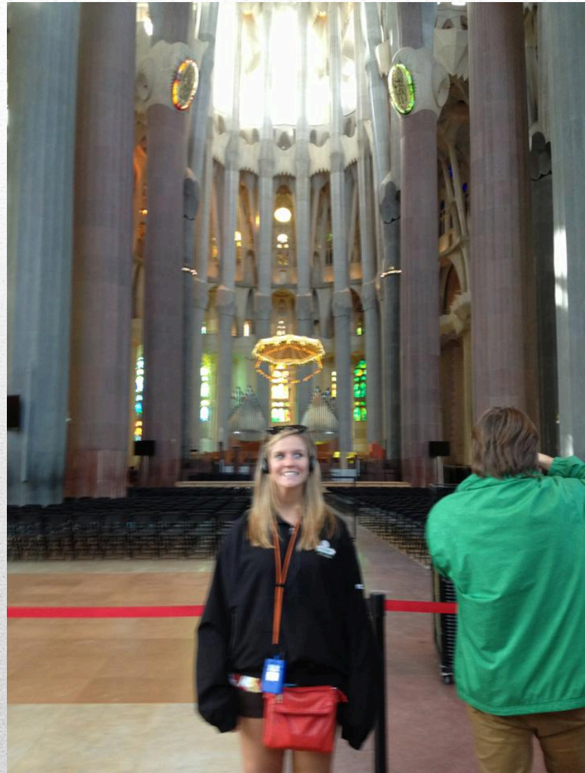
Inside of Gaudi's La Sagrada Familia