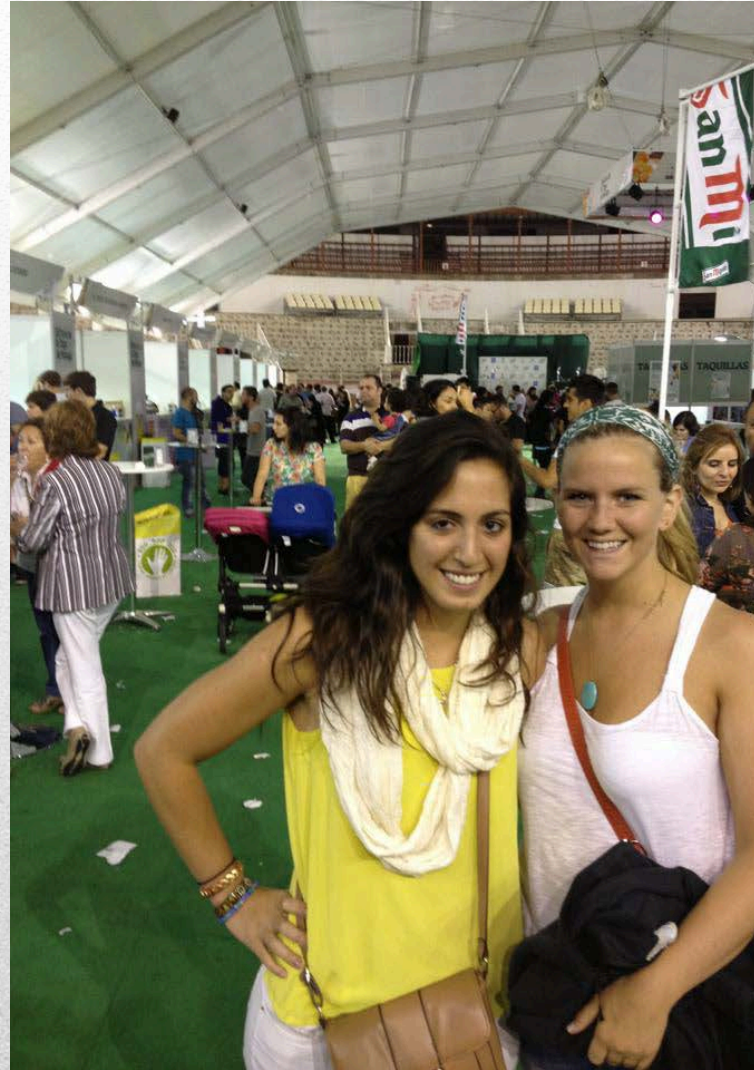
Le Feria de la Tapa de Málaga