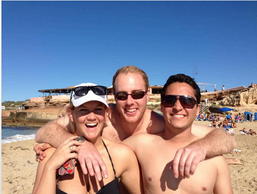
Cala Comte – Beautiful beach with crystal clear water