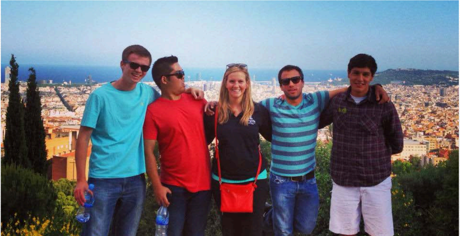
The view of Barcelona from the top of Gaudi's Park Güell