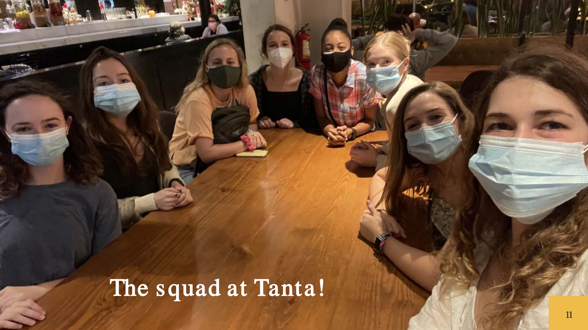
The squad at Tanta!