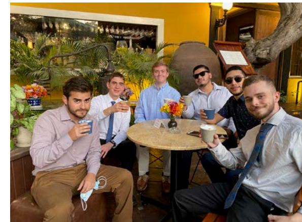
Huaca Pucllana (Lima)