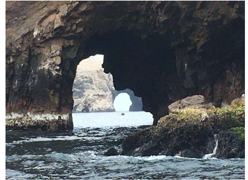
Islas Ballestas, Paracas