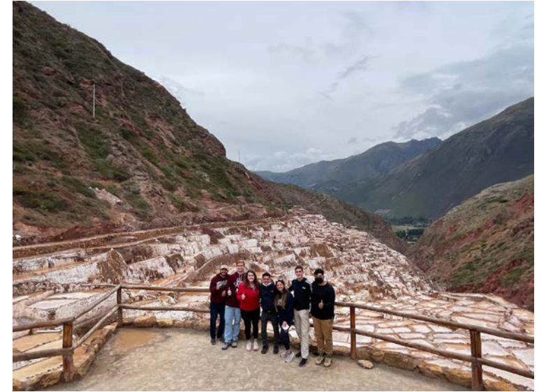
Salt Mines in Maras