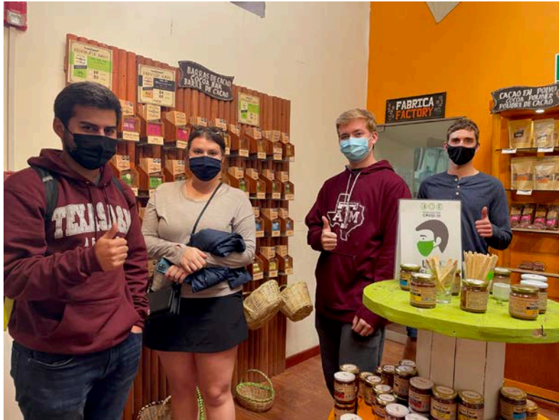
Chocolate Museum in Cusco