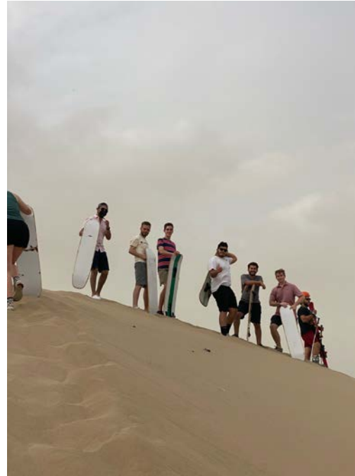
Sandboarding in Huacachina