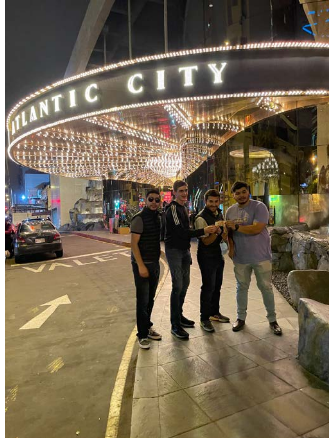
Atlantic City casino