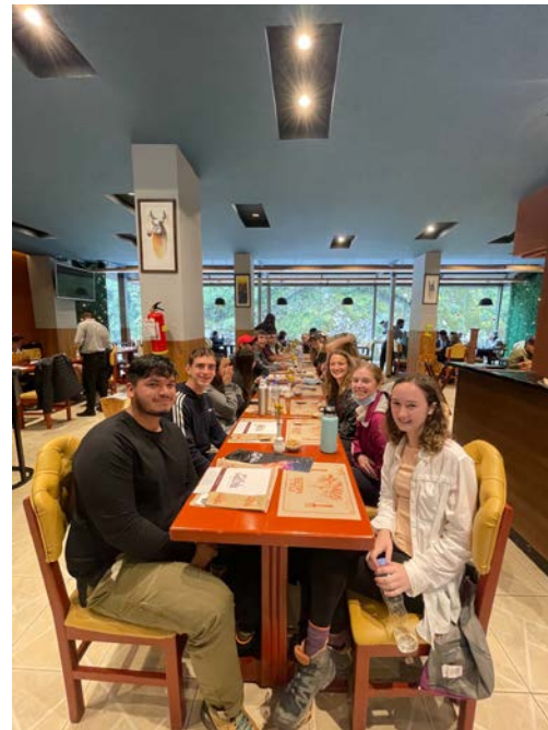
Full House in Aguas Calientes (Machu Picchu Pueblo)