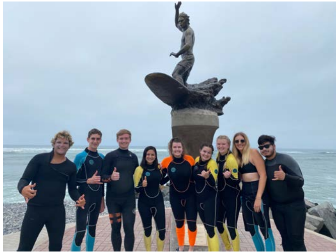
Surfing lessons in Miraflores