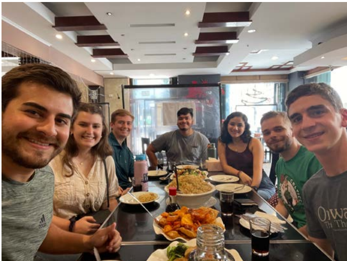
Chifa in Plaza de Armas