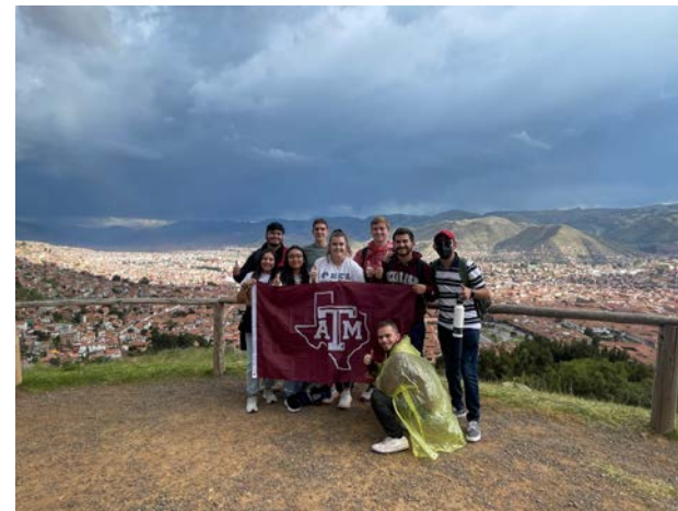
View of Cusco