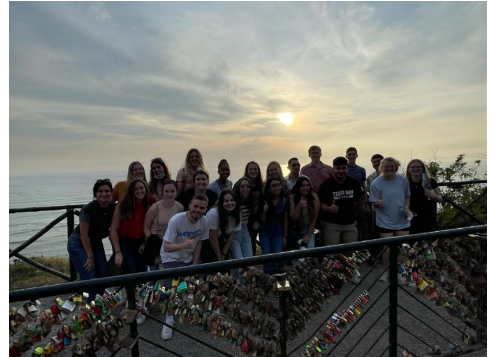
Miraflores/Barranco bus tour