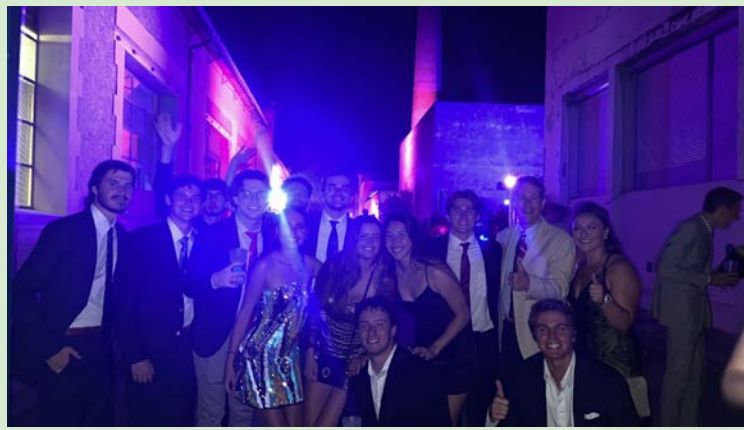
Arts et Metiers gala