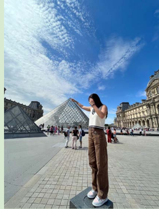
The Louvre Museum