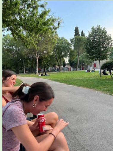
Lunch in Park Jourdan