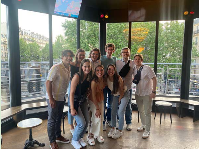
Our first night in Paris!