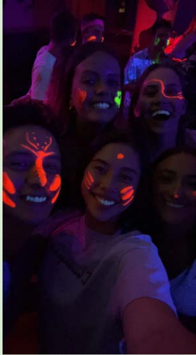
Neon party with french students!