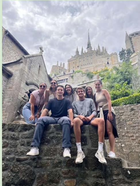
Mont St. Michel