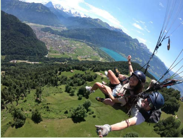
Paragliding 2200 ft in the air!