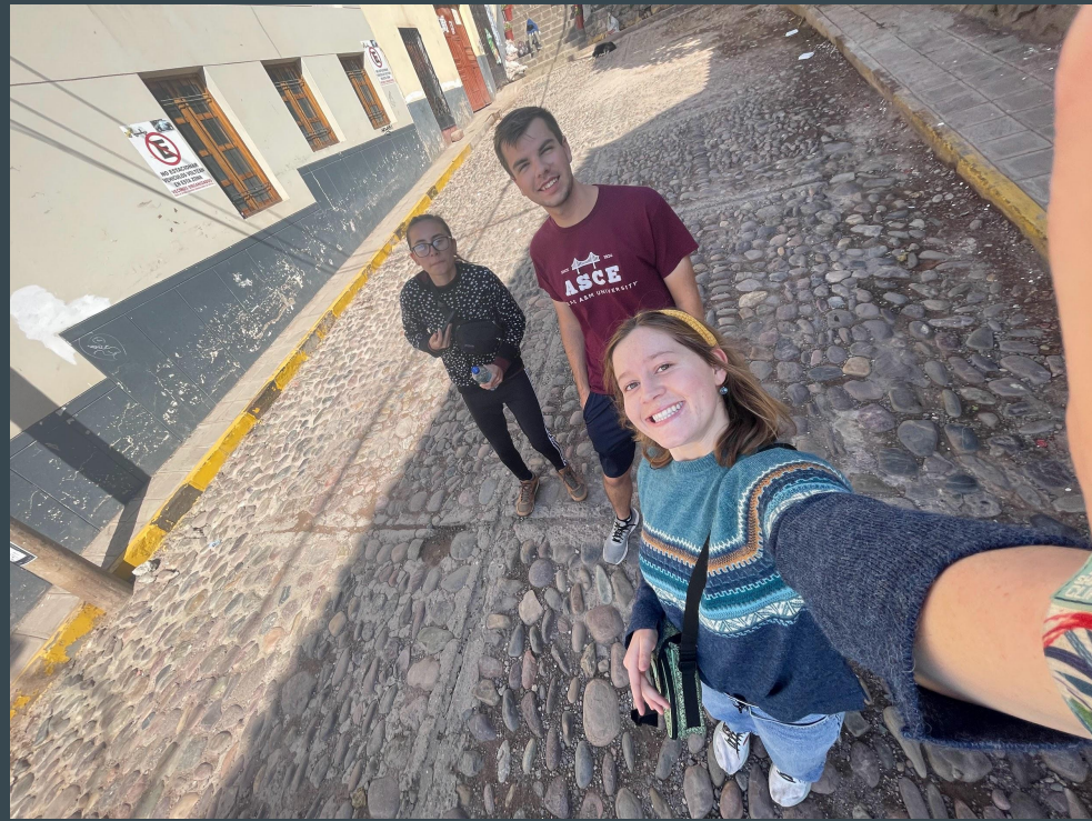
.5 selfie while exploring Cusco at 7:30am