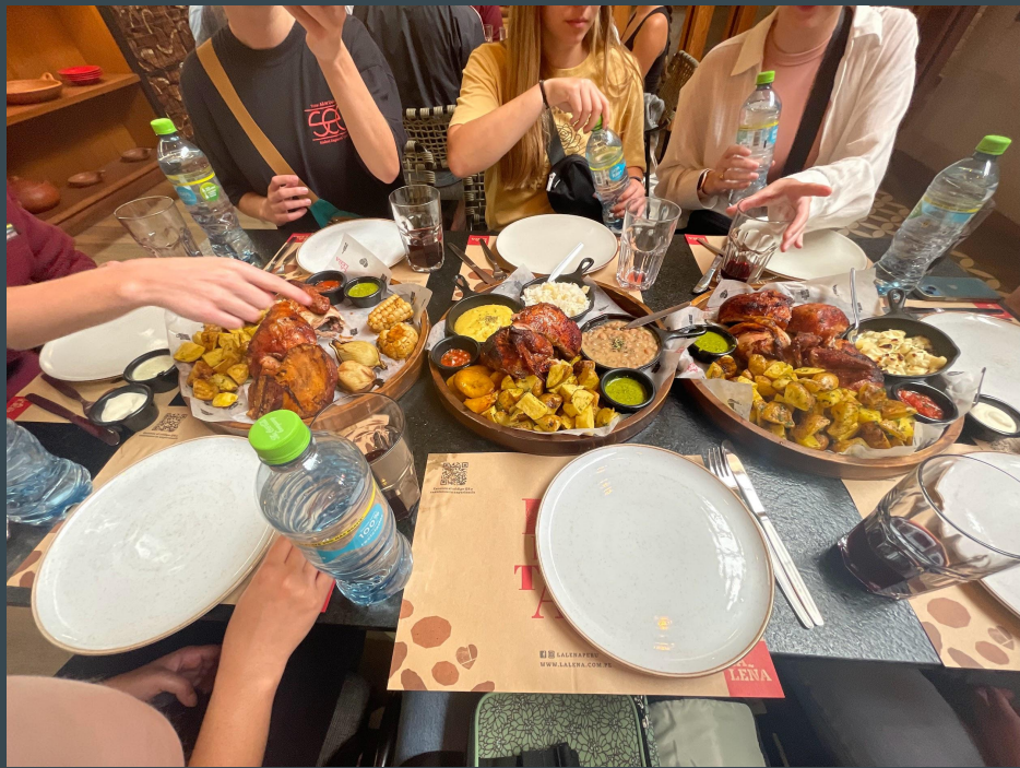
God Bless ceviche and cheap chicken plates