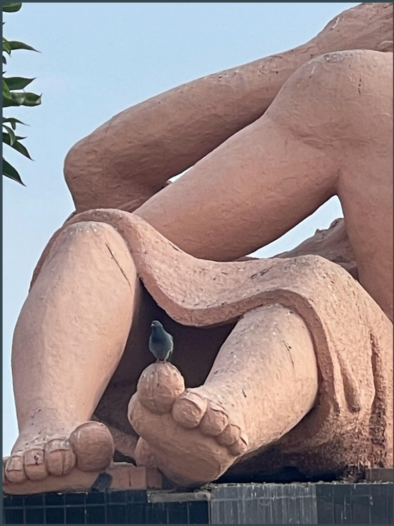
church steps and giant toes