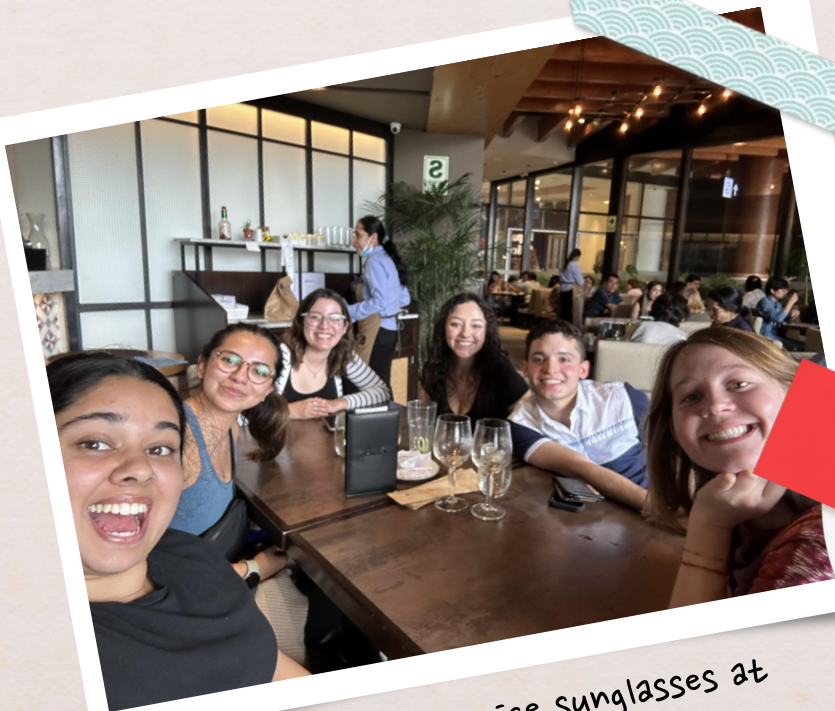
I bought some nice sunglasses at Real Plaza Salaverry too!