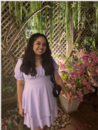
Dinner at Huaca Pucllana Restaurant - such an amazing experience