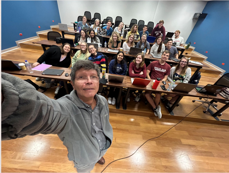
0.5 Picture on the Last Day of class!

Said goodbye to the little statues at the hotel, and the hotel as well!