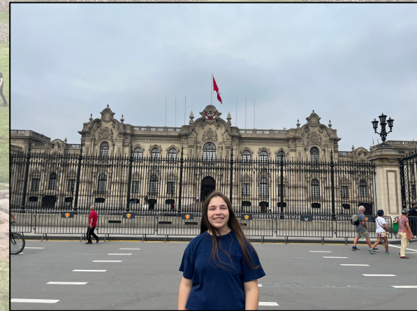
Historic Downtown Lima monastery, city square, cathedrals