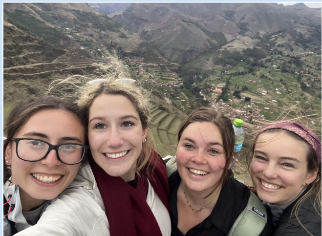
Third Day in Cusco!