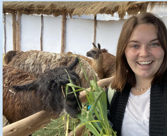
First Day in Cusco!