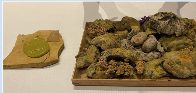
Group Dinner at Central!