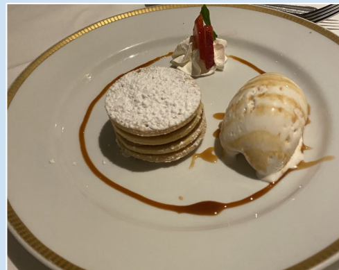
Group Dinner at La Rosa Nautica!