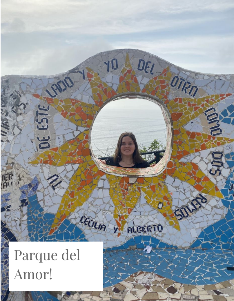
Parque del Amor!