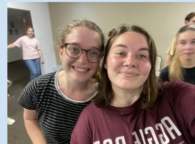
The best dance partner!! ^