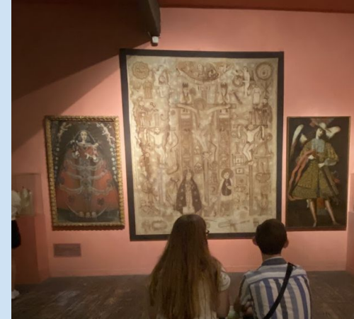
New Years Day (Museo Larco)!