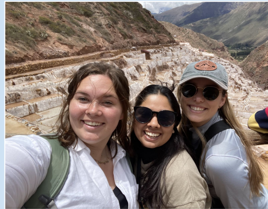
Second Day in Cusco!