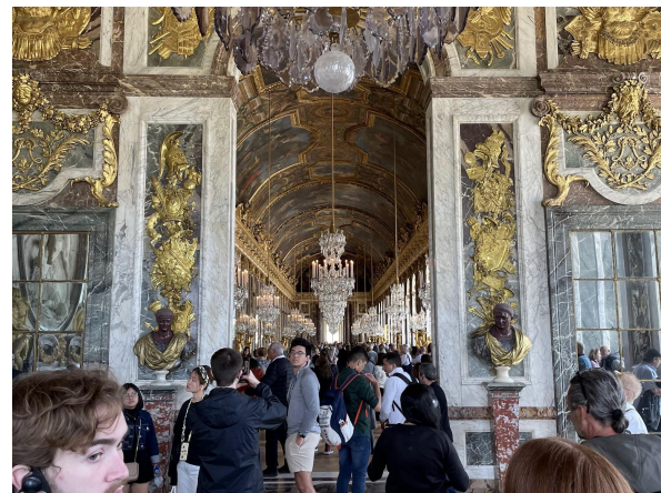
Hall Of Mirrors