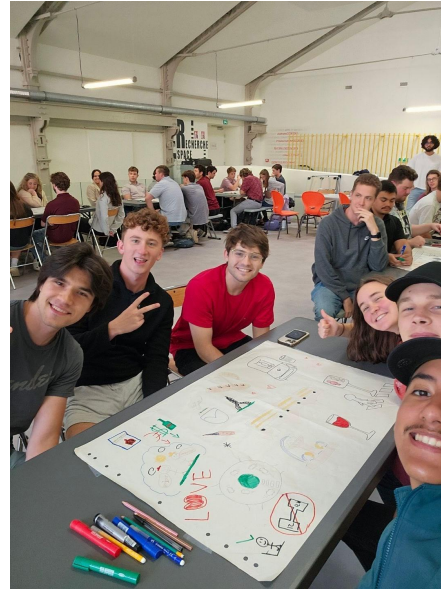
Mix and Mingle