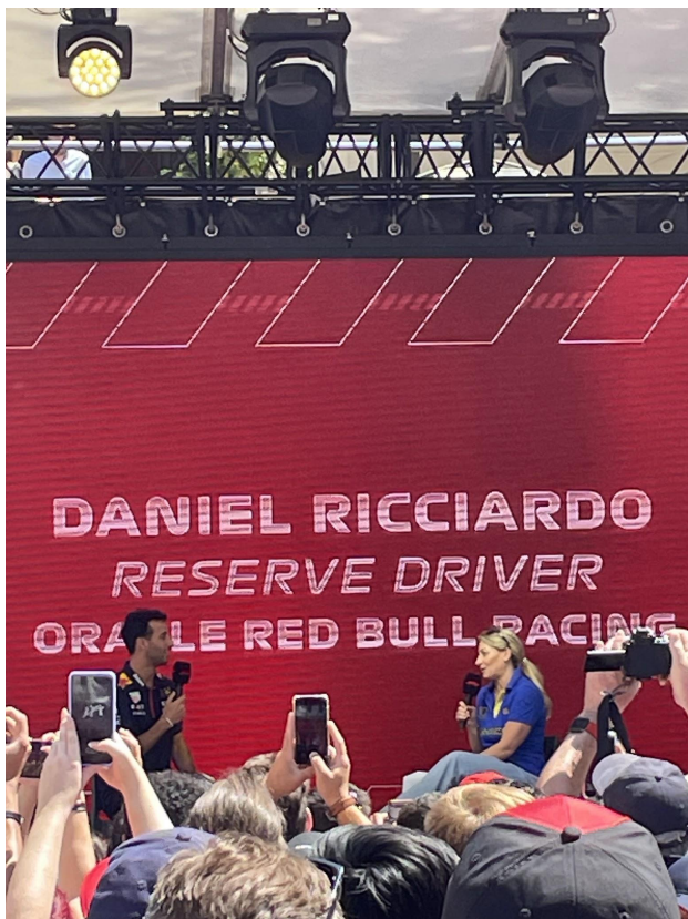
Seeing F1 Driver Daniel Ricciardo