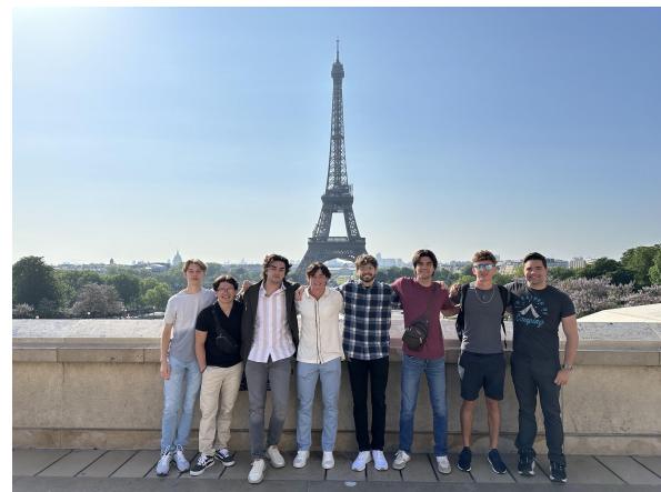
Making New Friends