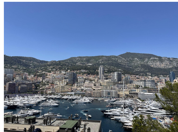
City View + F1 Viewing Spot