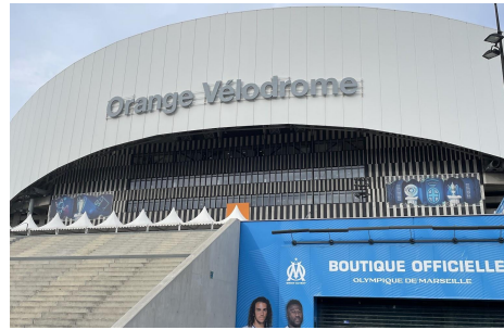
Marseille Football Stadium