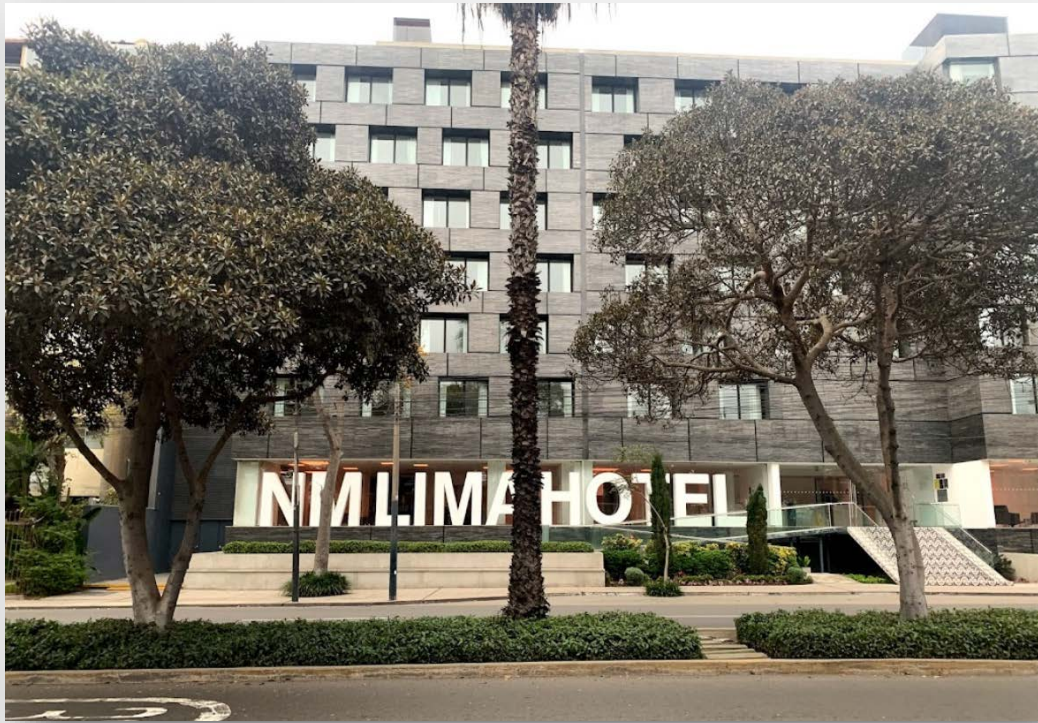
Lima: NM HOTEL.