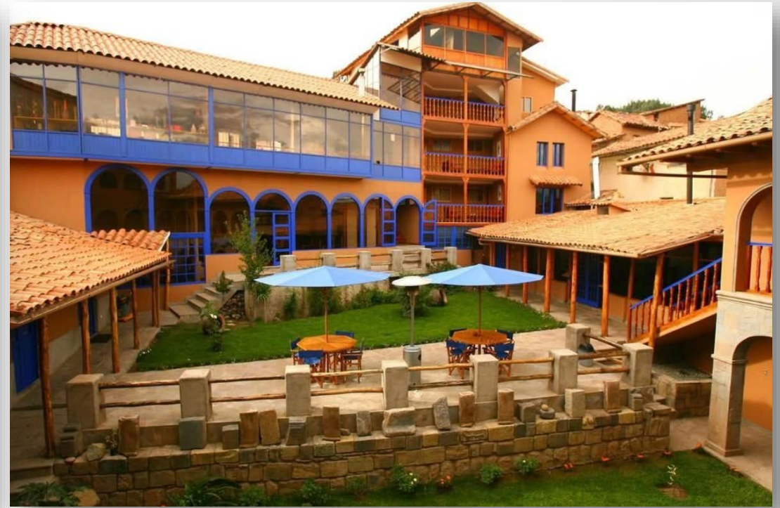
Cuzco: Casa Andina.