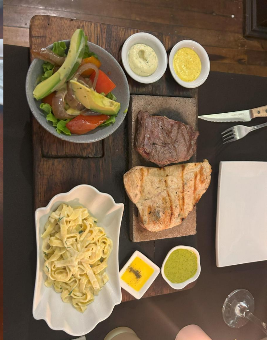
Food in Cusco