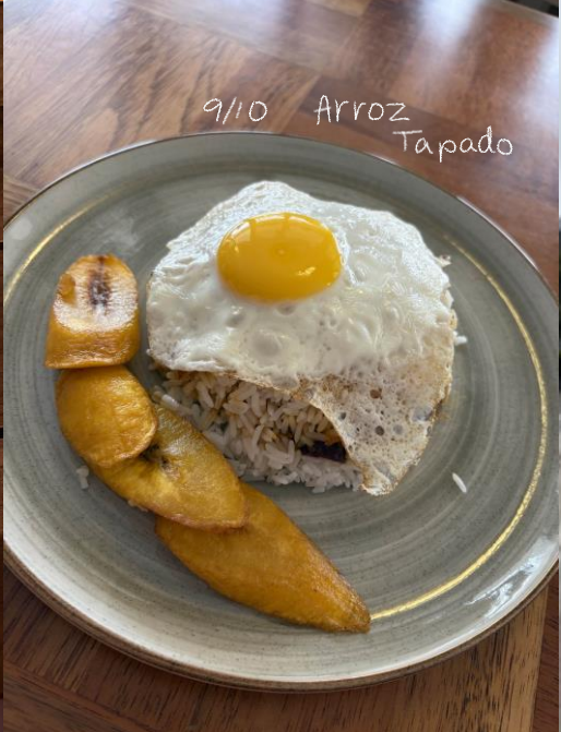
9/10 Arroz Tapado