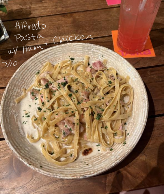
Alfredo Pasta w/ Ham + Chicken