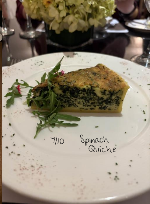
7/10 Spinach Quiche