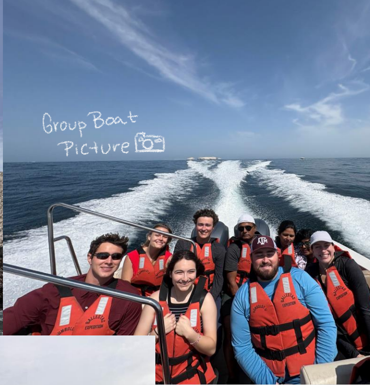
Group Boat Picture 📷