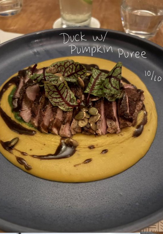
Duck w/ Pumpkin puree