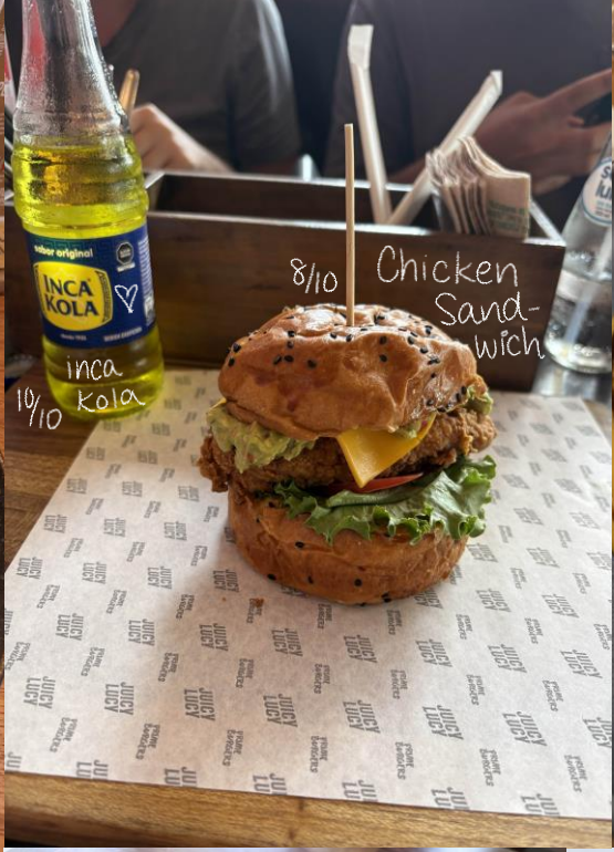
8/10 Chicken Sandwich