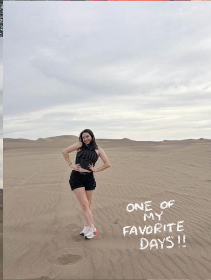
ONE OF MY FAVORITE DAYS!!