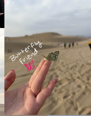
Butterfly Friend SK