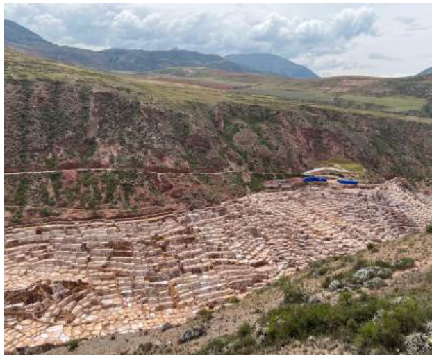
Salineras de Maras